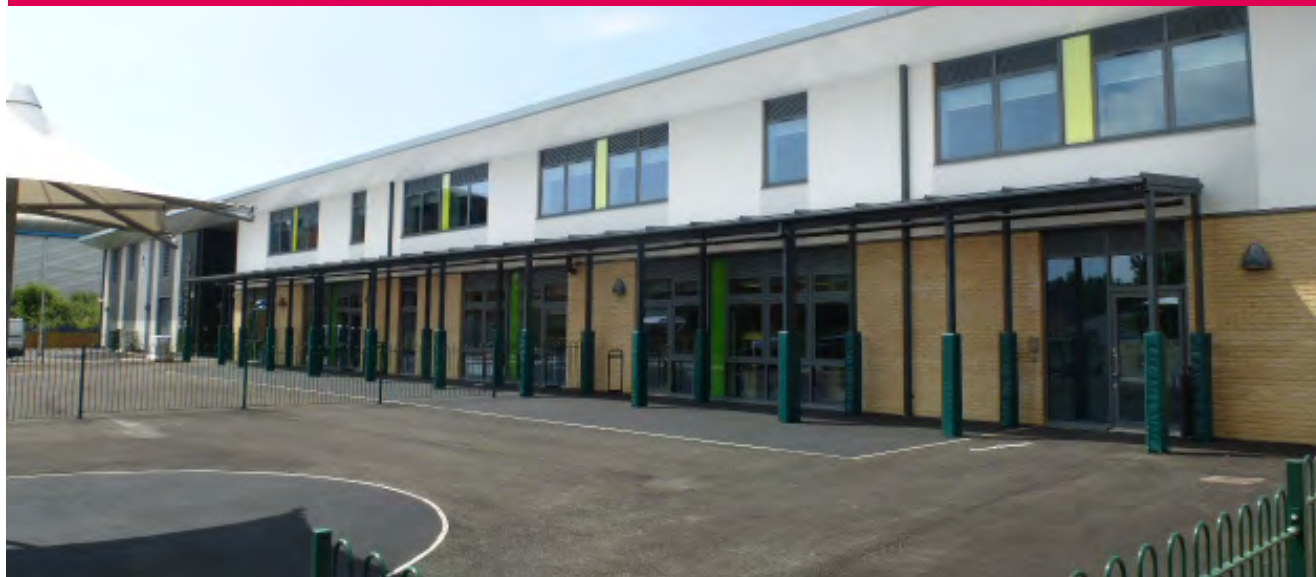
Recent new build primary school in Cardiff - Ysgol Glan Morfa

The new primary school is to be procured by the developer and construction is proposed to complete in Summer 2021.