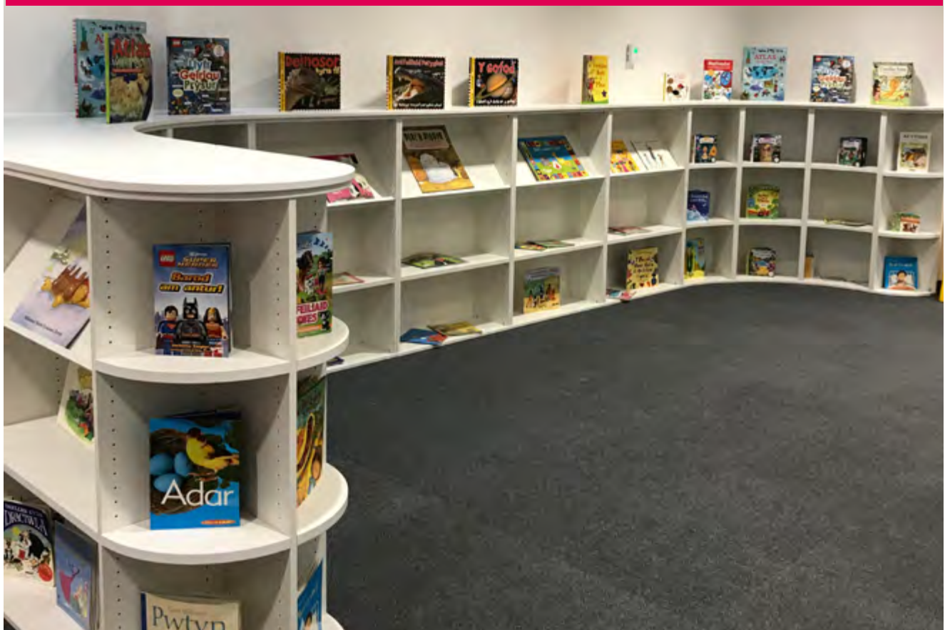
Recent new build primary school in Cardiff - Ysgol Hamadryad