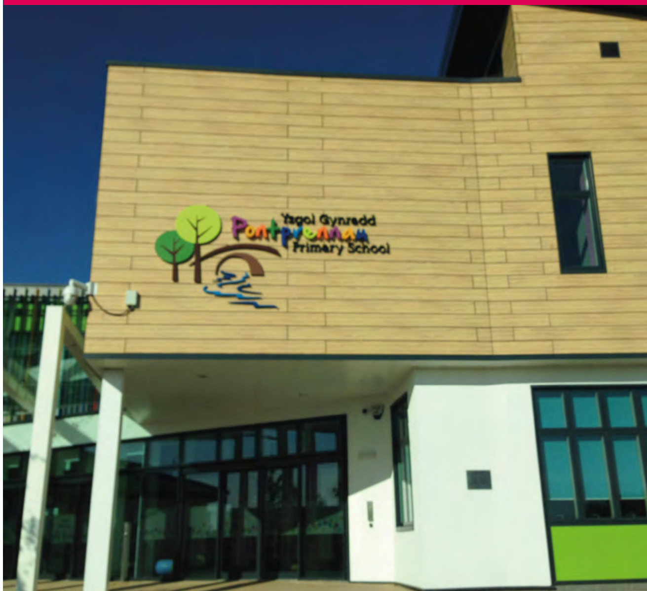
Recent new build primary school in Cardiff - Pontprennau Primary School

To date, approximately 90 houses have been completed and are occupied on the early phase of the development on the northern side of Llantrisant Road.