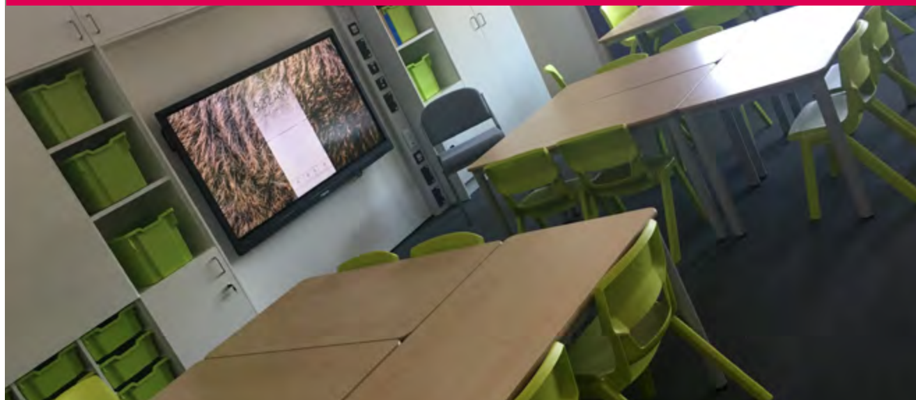
Recent new build primary school in Cardiff - Howardian Primary

Taking into account only the English-medium schools in closest proximity to the proposed new school to serve parts of the Plasdŵr development (namely Danescourt Primary School, Peter Lea Primary School and Radyr Primary School), there are very few surplus places (69) – approximately 6% of capacity.