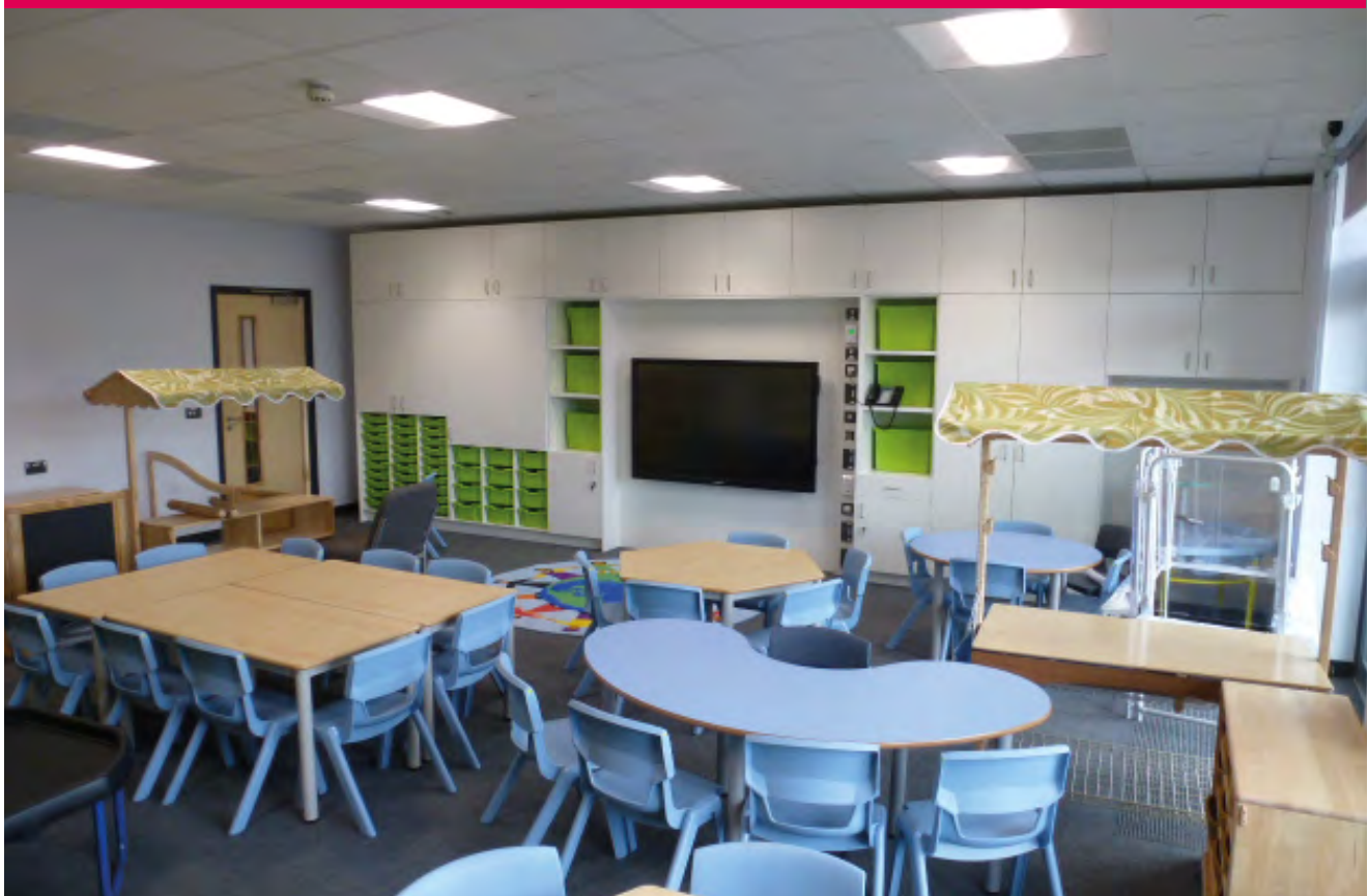
Classroom - Glan Morfa

The new Curriculum in Wales sets new expectations for schools and learners. There will be a single curriculum for Wales that will apply in Welsh-medium, English-medium and bilingual schools. The expectations in Wales for those learning Welsh in English-medium schools will gradually be increased as the first cohorts learn through the new curriculum in order to realise the national ambition of 1 million Welsh speakers by 2050.