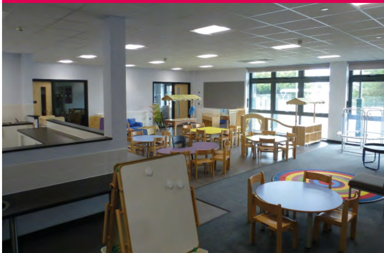
Recent new build primary school in Cardiff - Ysgol Glan Morfa

An offer of a nursery place at the school does not mean that a child will also be offered a place in Reception. A separate application form must be completed for admission to Reception.